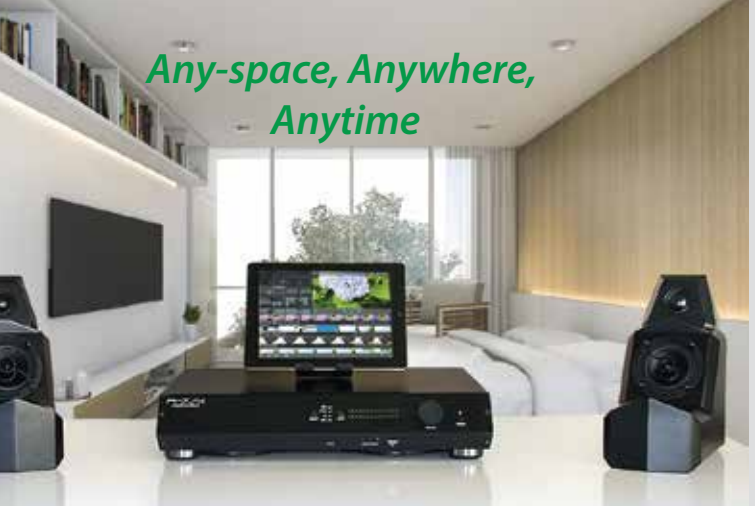
All the benefits of a full blown A/V Authoring System right on your desktop. 150 APPs