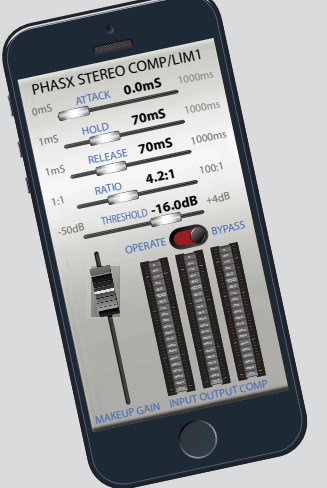
iPhone Not Included

Email us at: schools@ phasx.com For Academic/Student Pricing and Programs